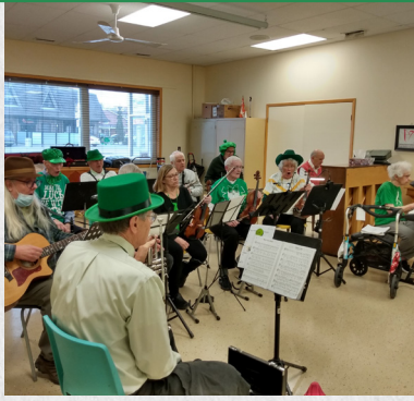
The Musical G's Half Century Centuries House Band